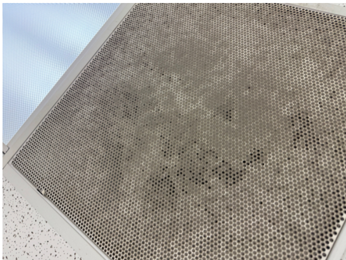
Evidence of roof leaking.

Mold Inspection & Testing | MI&T Nationwide Unbiased Mold Testing Website: http://mitmold.com 855-600-6653 | Office@mitmold.com