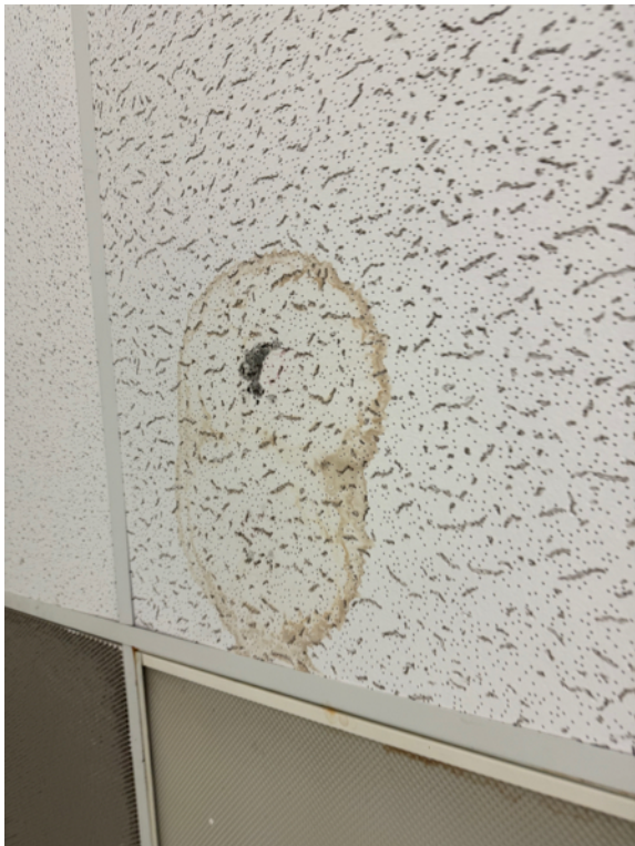
Evidence of roof leaking.