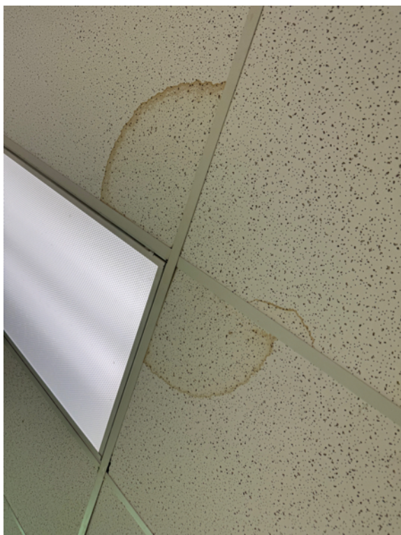
Evidence of roof leaking.